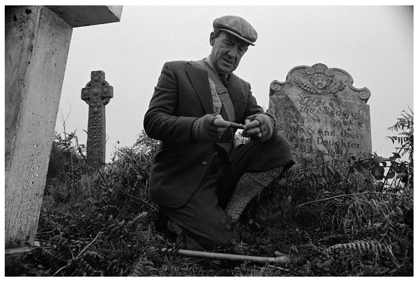
Whistle and I'll Come to You @ BBC. Courtesy of BFI.

dominated by pastiche and reiteration, hauntological music found itself at the heart of a paradox. Could the only opposition to a culture dominated by what Jameson calls the "nostalgia mode" be a kind of nostalgia for modernism?