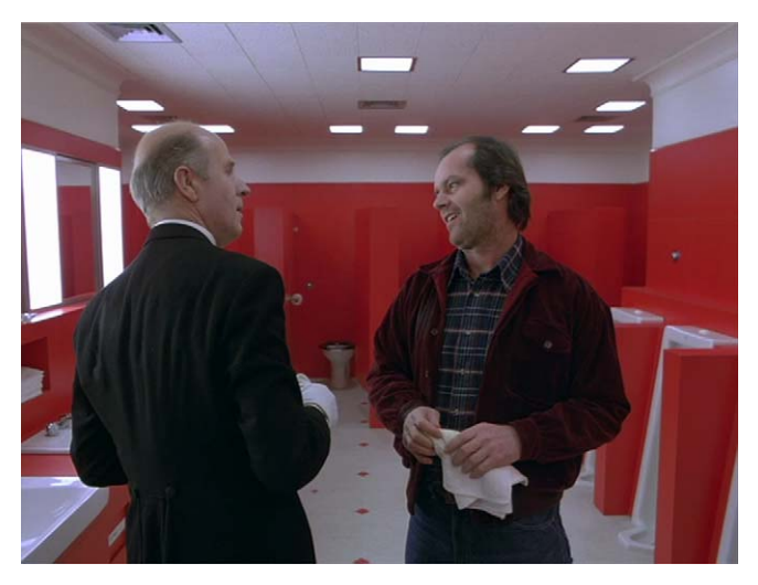
The Shining: Torrance and Grady