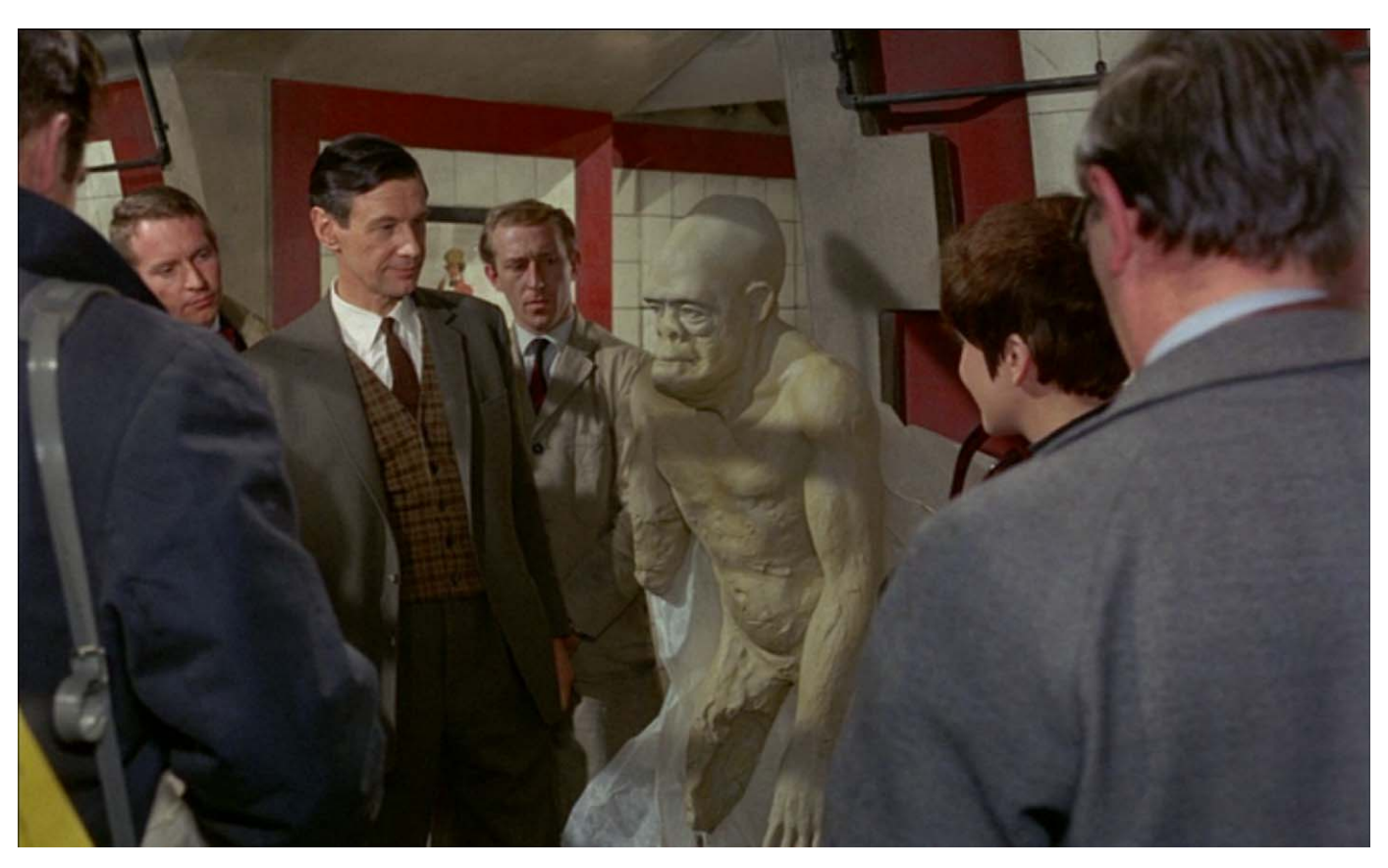
Quatermass and the Pit