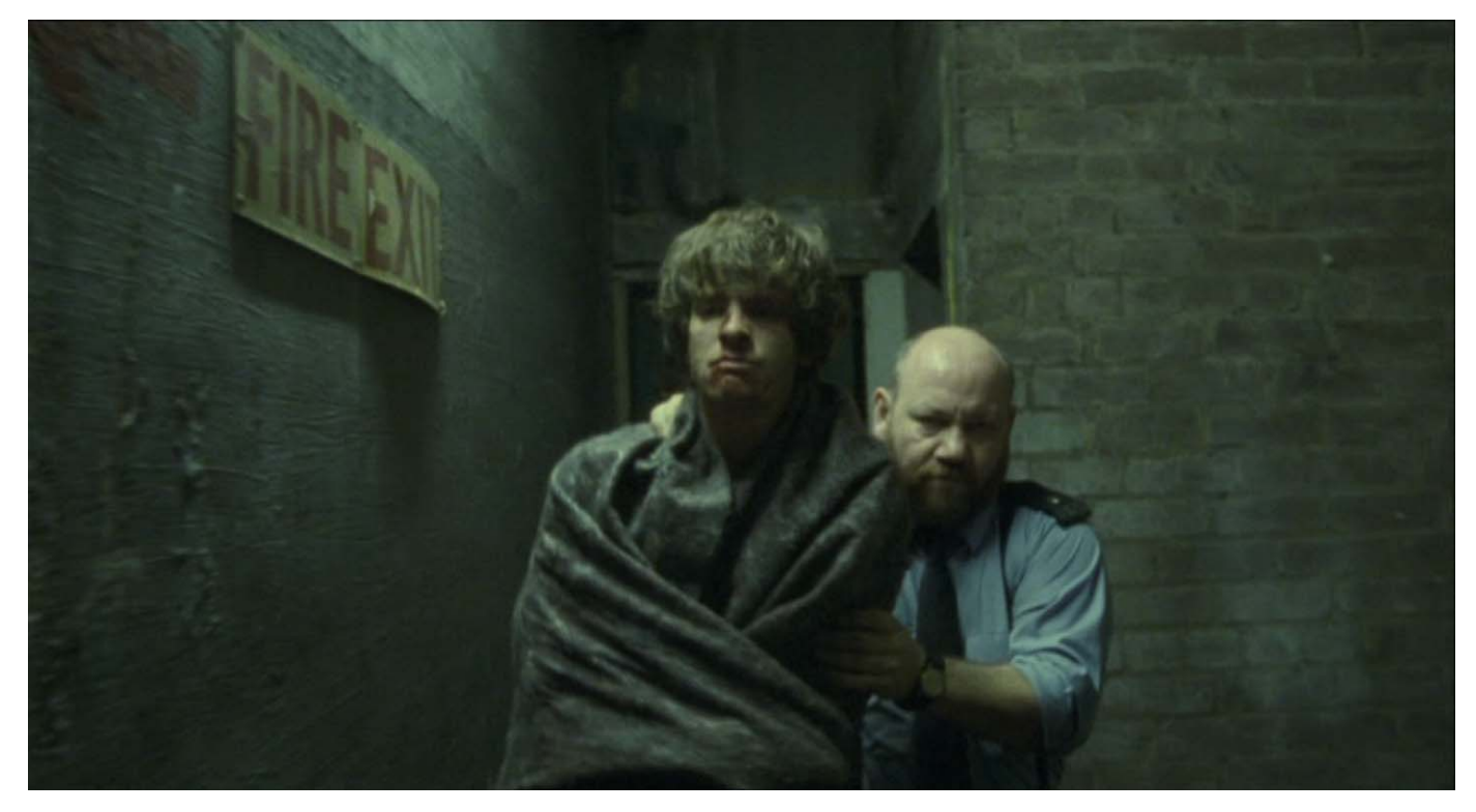
The Red Riding Trilogy: 1974 © 2009 Red Riding 1974 Limited. DVD: Optimum Home Entertainment (U.K.).

telepathically, and Quatermass and the Pit amounts to nothing less than a retelling of human history. Phenomena that seemed to be supernatural through the ages are explained as encounters with the Martian travellers who—in a twist that anticipates the recent Prometheus —interbred with apes in order to produce the human species as we now know it. The xenolithic artifact triggers a traumatic, deeply suppressed race memory of these alien origins.