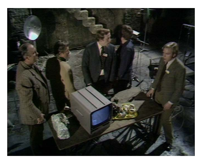
The Stone Tape

the consumer present, together with a conspicuous use of digitally enabled technologies such as CGI. Yet this anxious insistence on the paraphernalia of the contemporary obfuscates the fact that the formal features of what we are seeing and hearing are familiar to the point of being exhausted. Relentless technological upgrades—the same thing, seen and/or heard on a new platform—disguise the disappearance of formal innovation and new kind of sensory experience.