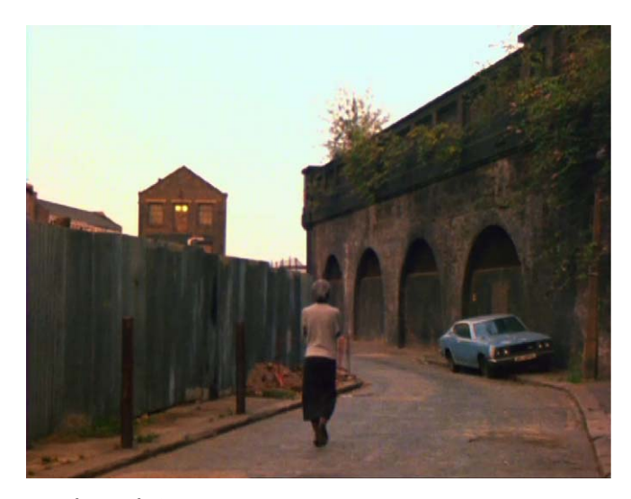
Handsworth Songs

Film Quarterly, Vol. 66, No. 1, pps 16-24, ISSN 0015-1386, electronic ISSN 1533-8630. © 2012 by the Regents of the University of California. All rights reserved. Please direct all requests for permission to photocopy or reproduce article content through the University of California Press's Rights and Permissions website, http://www.ucpressjournals.com/reprintinfo.asp. DOI: 10.1525/FQ.2012.66.1.16