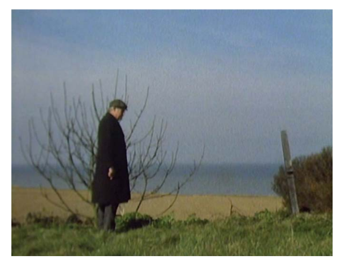
A Warning to the Curious

as it can be seen in all the revenants from earlier moments in the hotel's history that menace and seduce Jack.