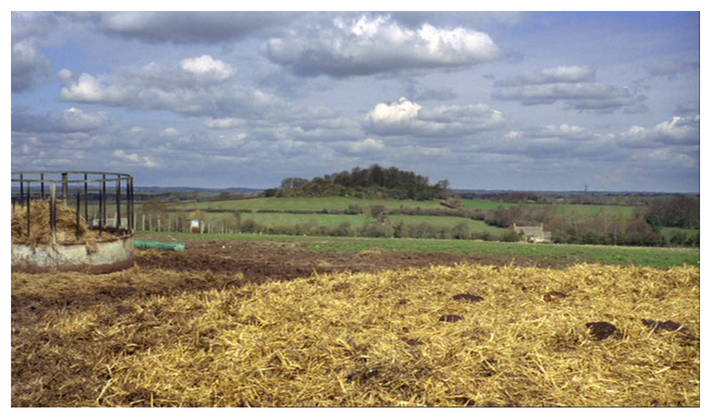
Robinson in Ruins © 2010 Patrick Keiller and the Royal College of Art. DVD: BFI Video (U.K.).